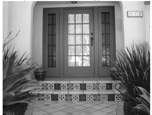
Balanced Perfection. Restoration efforts have yielded a welcoming front entrance befitting the 1925 home.