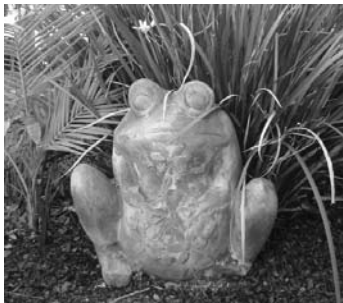
A playful touch is this pottery of Mr. Silly Frogface placed along the driveway.

aim is to keep the feel of the original home and they have succeeded beautifully.