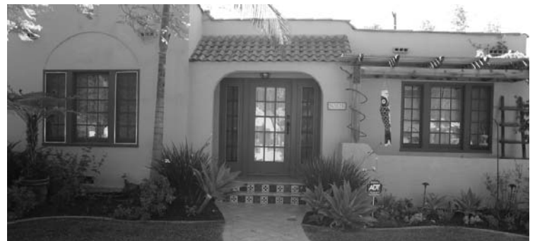
There is no doubting the curb appeal of the Nelson-Enloe's fastidiously maintained home.